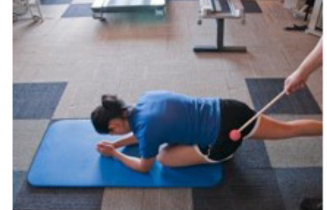
Stretch Piriformis step 4/4