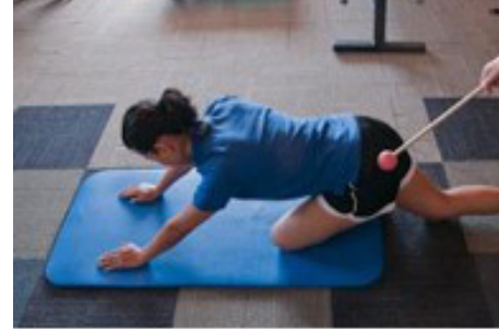
Stretch Piriformis step 3/4